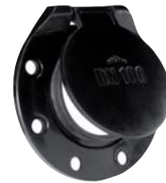
Wall Mounting or Flange ISO PN10