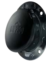
Wall Mounting or Flange ISO PN10 (from ND 200 to 600)