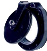
Wall Mounting or Flange ISO PN10 & Eye nut (AISI 316)

Eye nut is standard and included in unit.