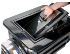
Insert into valve