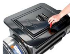
Align and screw tight