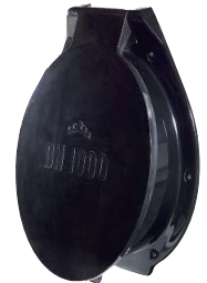
Wall Mounting (from ND 600 to 1500)